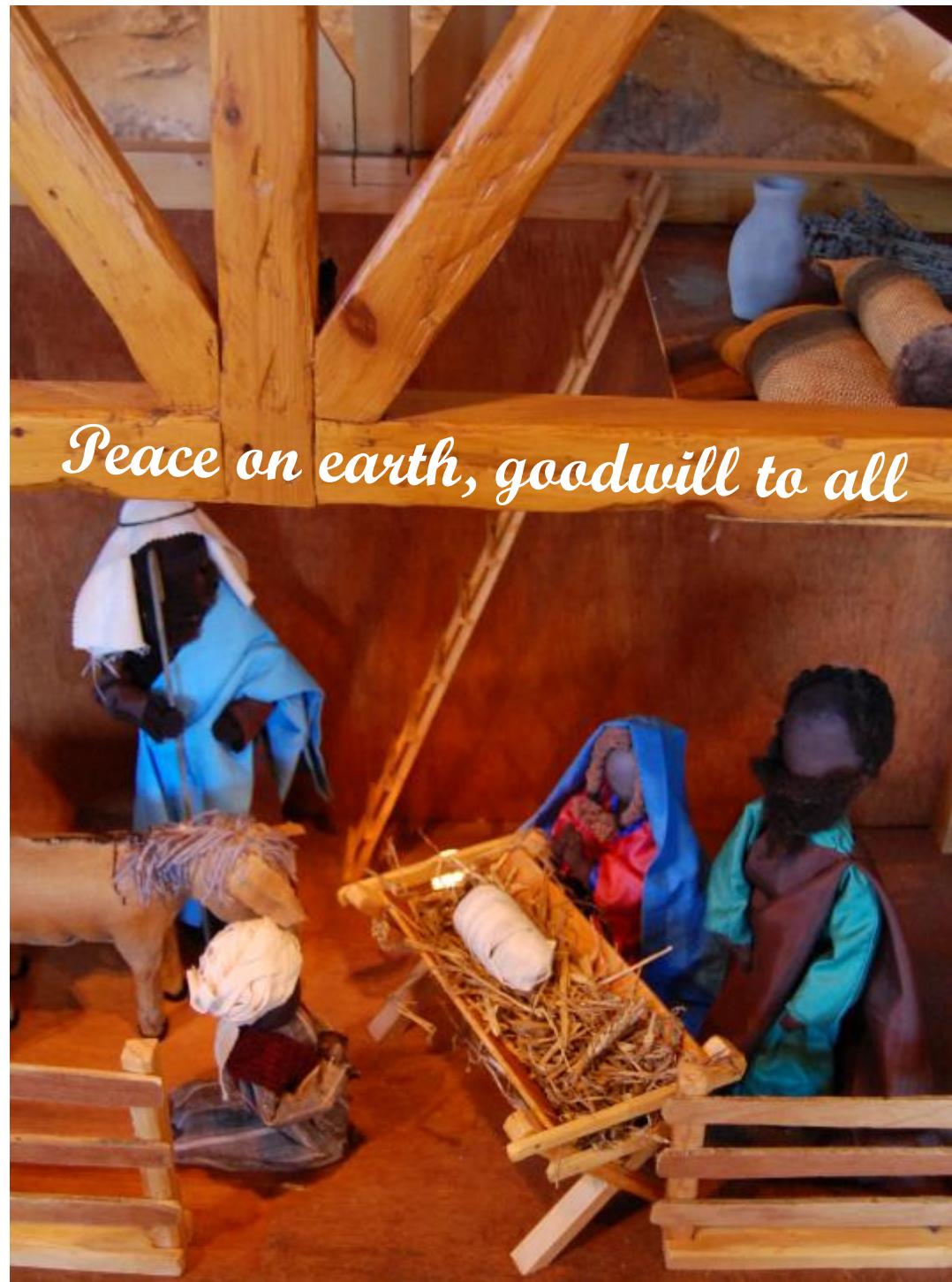
Pilsdon at Malling